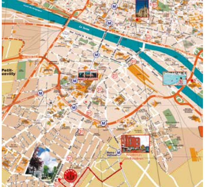
City Map showing FIN

Because we don't just say we care, we really do!