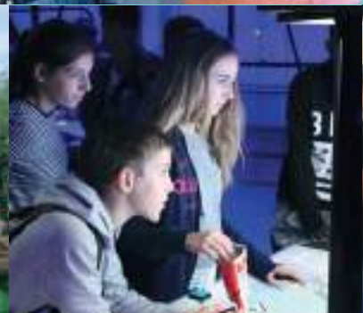
INCLUDED FULL DAY