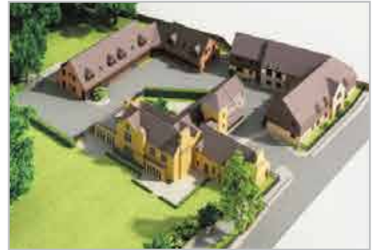
The Grange is a 5 minute drive away from Taunton School